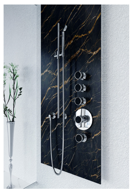
JÖRGER, Product line Valencia, concealed shower combination in chrome

In-keeping with the style, surface finishes are available in chrome, platinum matte, precious brass, fine brass matte, bronze, mink, mink matte, gold, rose gold, bronze, silver nickel, matte nickel, matte black and matte white.