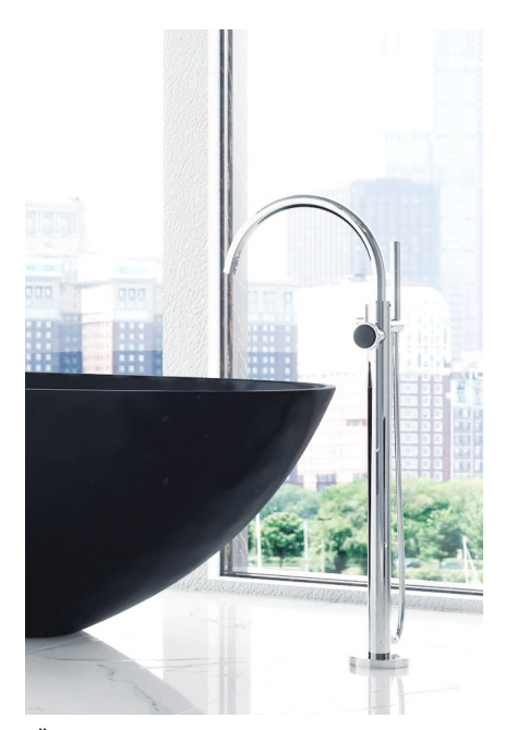
JÖRGER, Product line Valencia, Tub/shower mixer in chrome