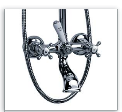
DELPHI, cross handle

Armaturen- u. Accessoiresfabrik GmbH Seckenheimer Landstraße 270-280 68163 Mannheim / Germany Telefon :+49 (0)621-4109701 Telefax :+49 (0)621-4109710 E-Mail :info@joerger.de Internet :www.joerger.de