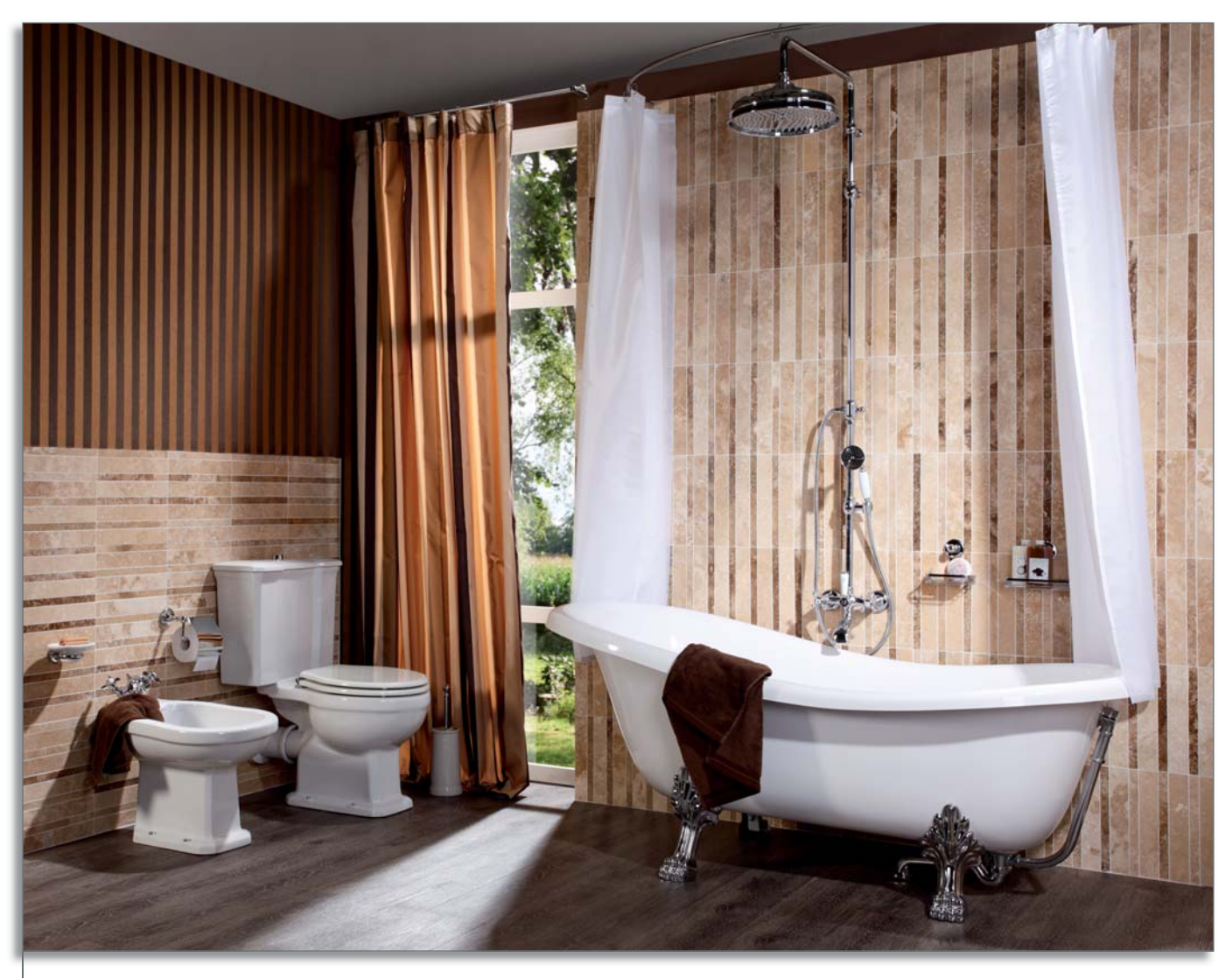
Exposed tub/shower mixer with supply pipe combination, Series 1909

Armaturen- u. Accessoiresfabrik GmbH Seckenheimer Landstraße 270-280 68163 Mannheim / Germany Telefon :+49 (0)621-4109701 Telefax :+49 (0)621-4109710 E-Mail :info@joerger.de Internet :www.joerger.de