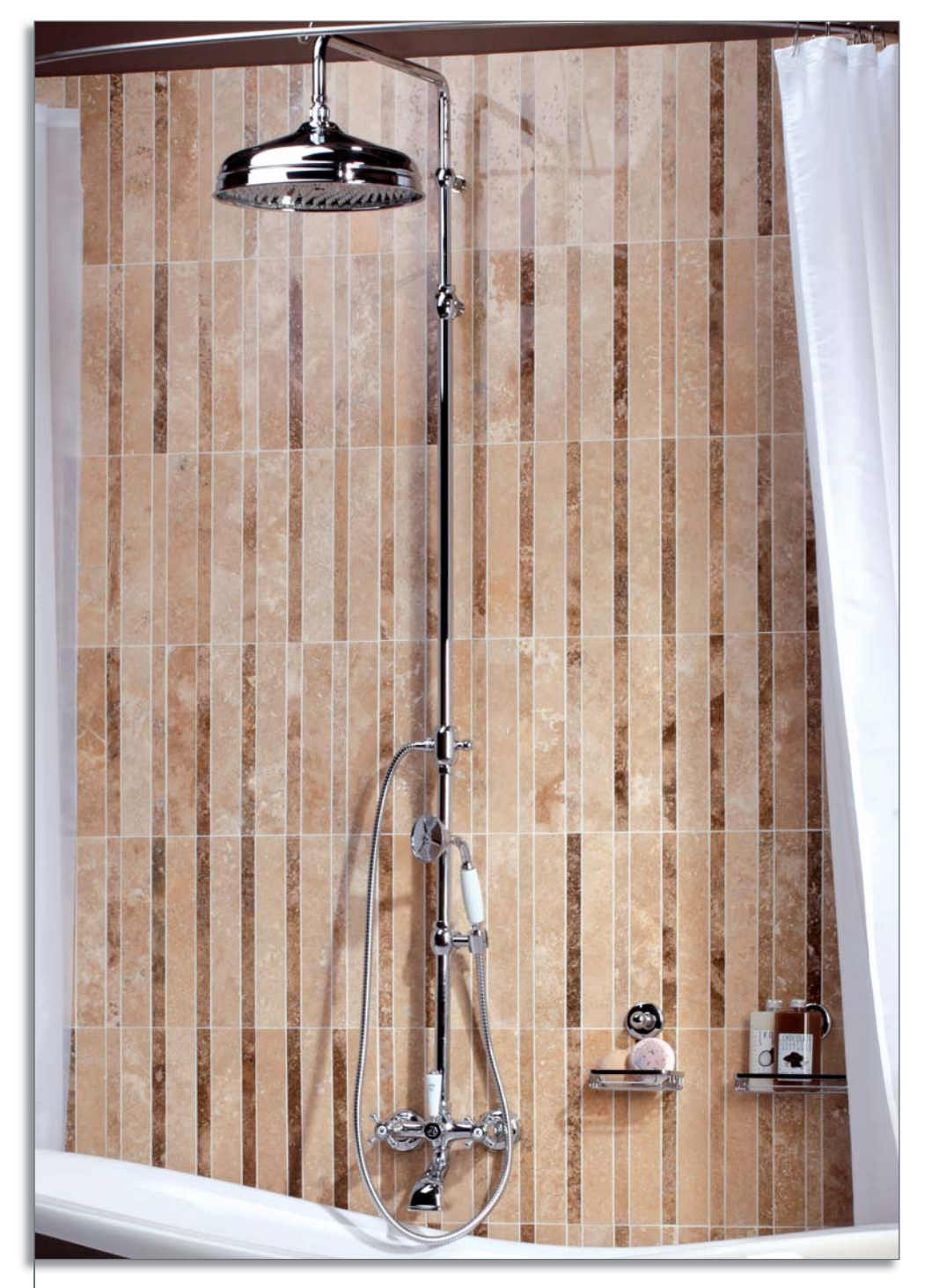
Exposed tub/shower mixer with supply pipe combination, Series DELPHI

Armaturen- u. Accessoiresfabrik GmbH Seckenheimer Landstraße 270-280 68163 Mannheim / Germany Telefon : +49 (0)621-4109701 Telefax : +49 (0)621-4109710 E-Mail : info@joerger.de Internet : www.joerger.de