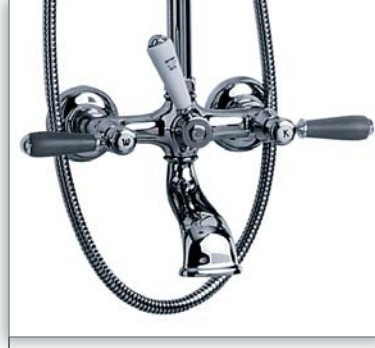
DELPHI, lever handle wood